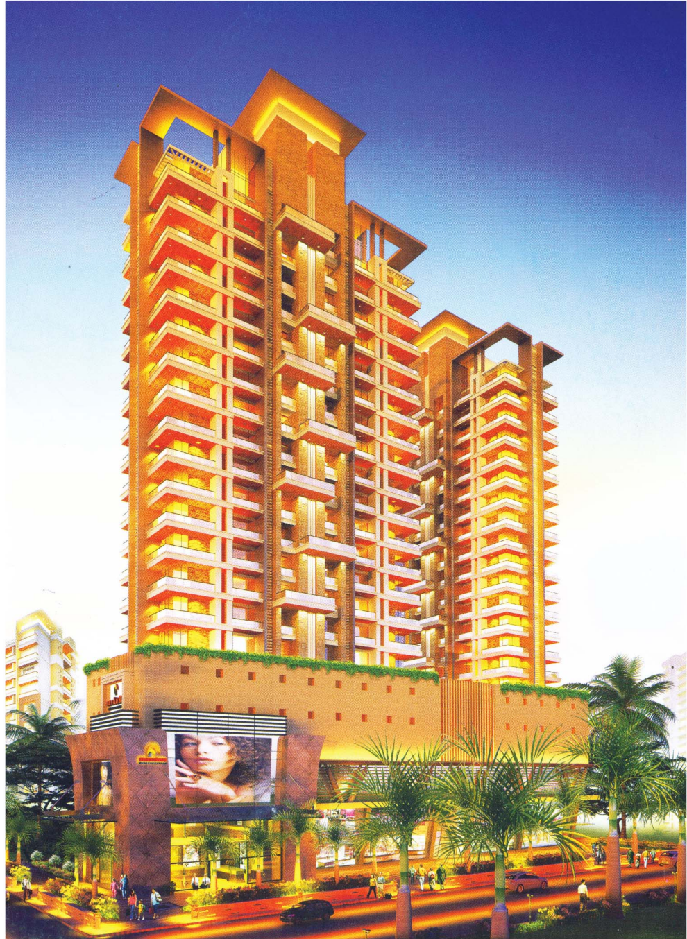
“ Navkar Paradise ” L.T. Road, Borivali (W), Mumbai.