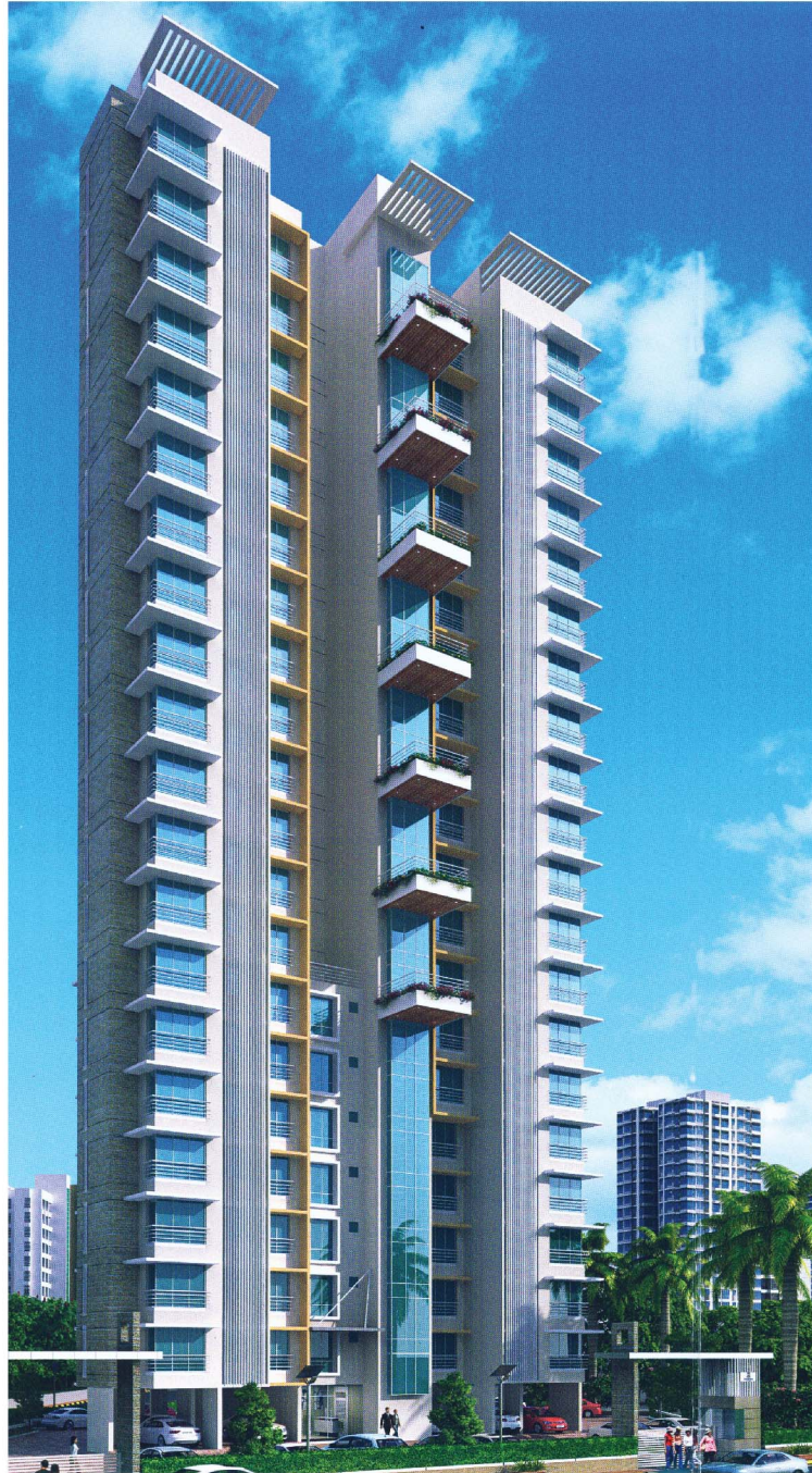
“ Hari Tara Residency ” Mhatre Wadi, Dahisar (W), Mumbai.