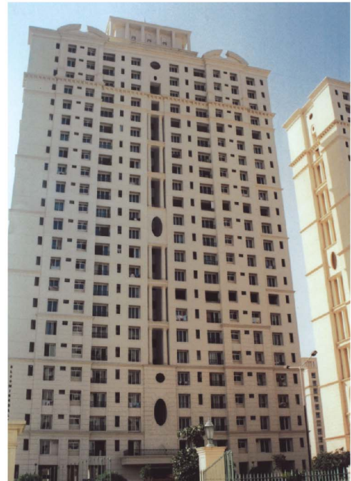
“ Blooming Dale ” Hiranandani Estate, Patilpada, Thane (w).