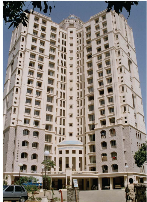
“ Green Wood ” Hiranandani Estate, Thane (w).