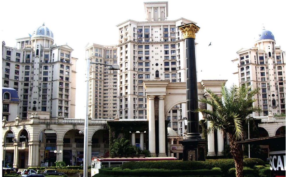
"Galleria Shopping Mall", "Florentine", "Valencia", Hiranandani Gardens, Powai.