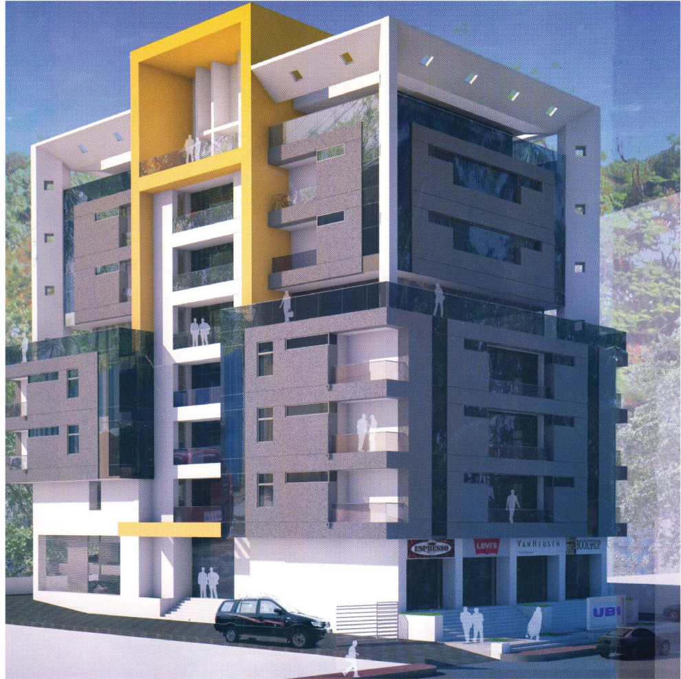
"United Business I.T. Park" Wagle Ind. Estate, Thane (W)