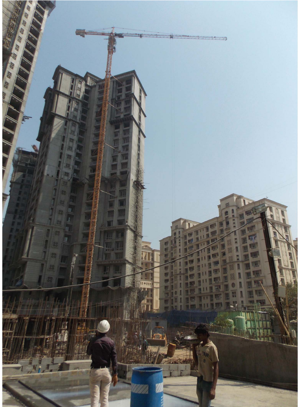
“ Clayton” (Work in progress) Rodas Enclave, Hiranandani Estate, Off. Ghodbunder Road, Thane.