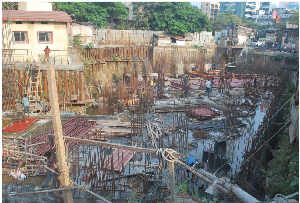
“ Tulsi Chamber” (Work in progress) Opp. Swastik Chambers, Chembur, Mumbai