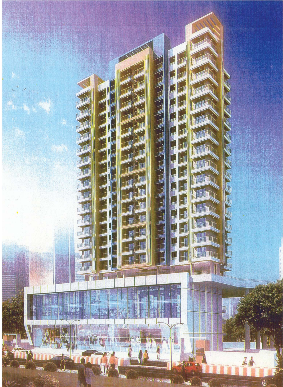
“ Navkar Pallazo ” Village Eksar, Link Road, Borivali (W), Mumbai.