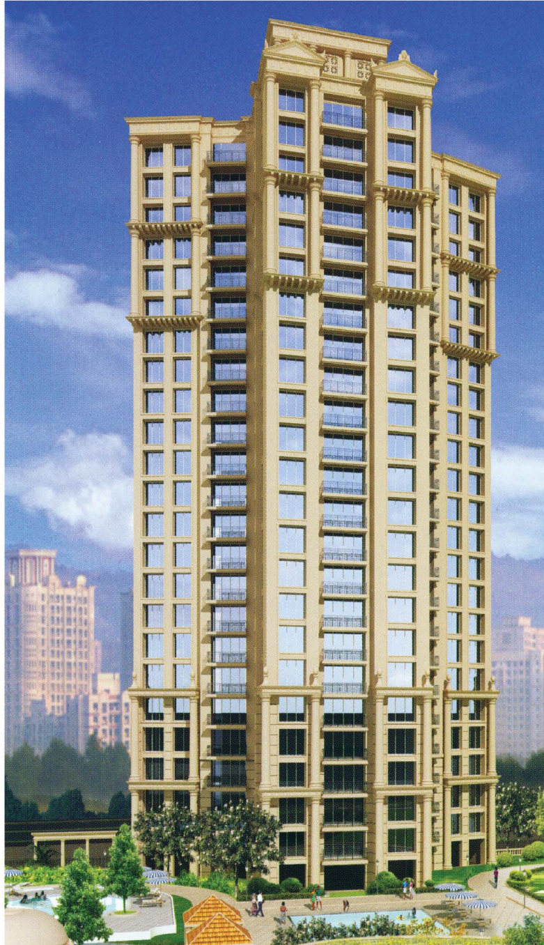
“ Clayton ” Rodas Enclave, Hiranandani Estate, Off. Ghodbunder Road, Thane.