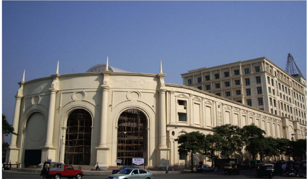
“ Powai Plaza ” Hiranandani Gardens, Powai.