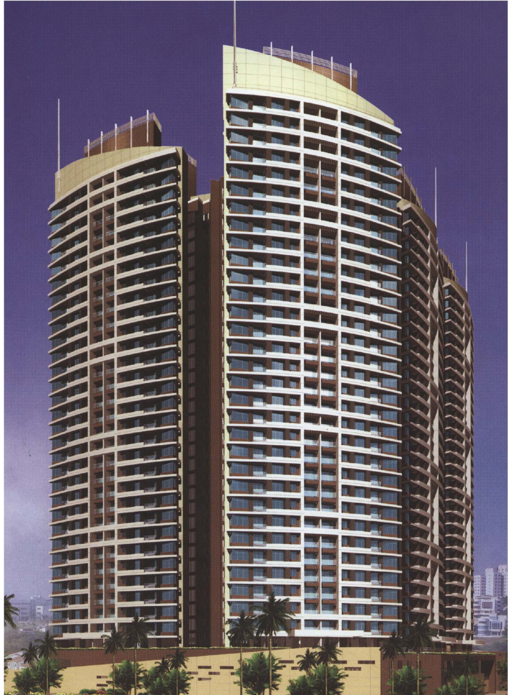
“ Kalpataru Towers ” Off Akurli Road, Kandivali (e).