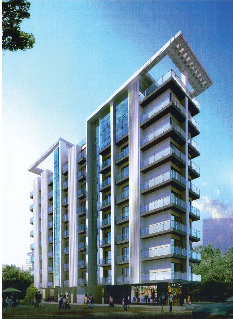
“ Navkar Pearl ” Natakwala lane, Off. S. V. Road, Borivali (W), Mumbai.