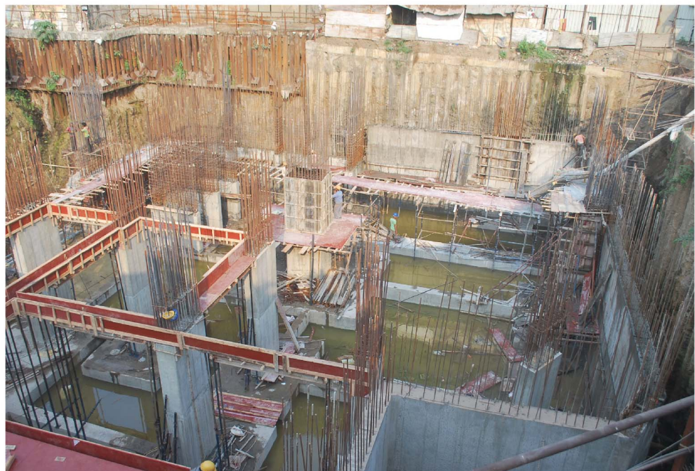
“ Tulsi Chamber” (Work in progress) Opp. Swastik Chambers, Chembur, Mumbai