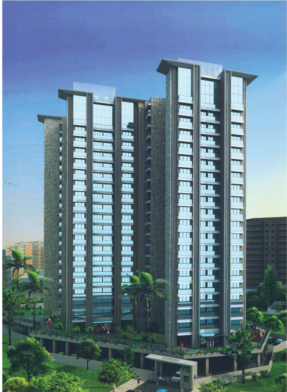
“Happy Homes” I. C. Colony, Borivali (W), Mumbai.