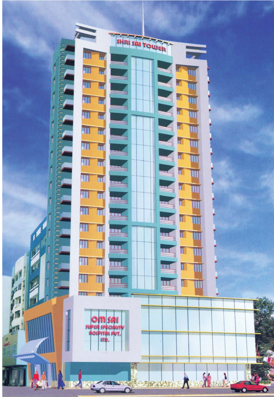
“Shree Sai Tower” Nutan Nagar, Sodawala Lane, Borivali (W), Mumbai.