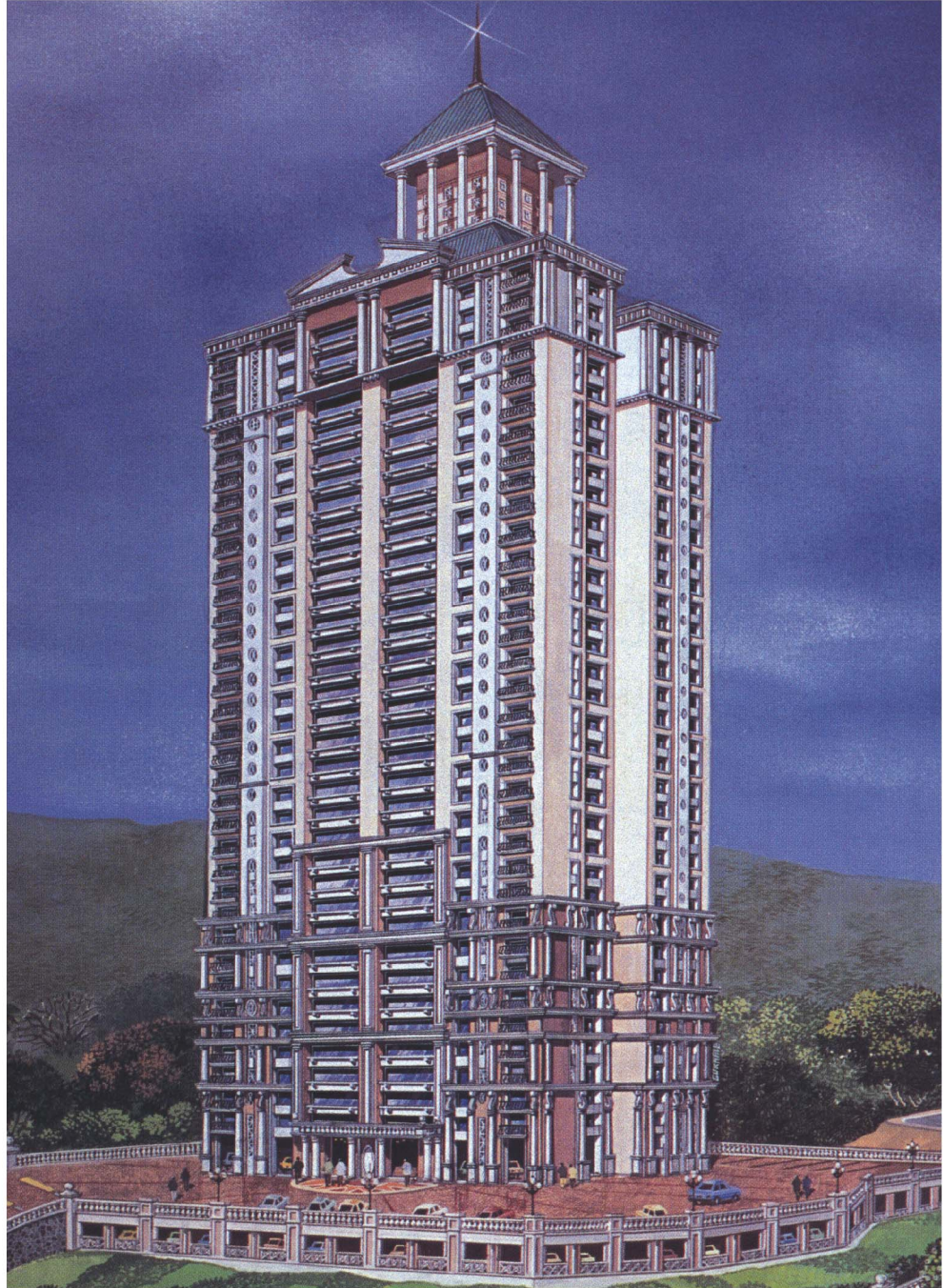
“ Torino ” Hiranandani Gardens, Powai.