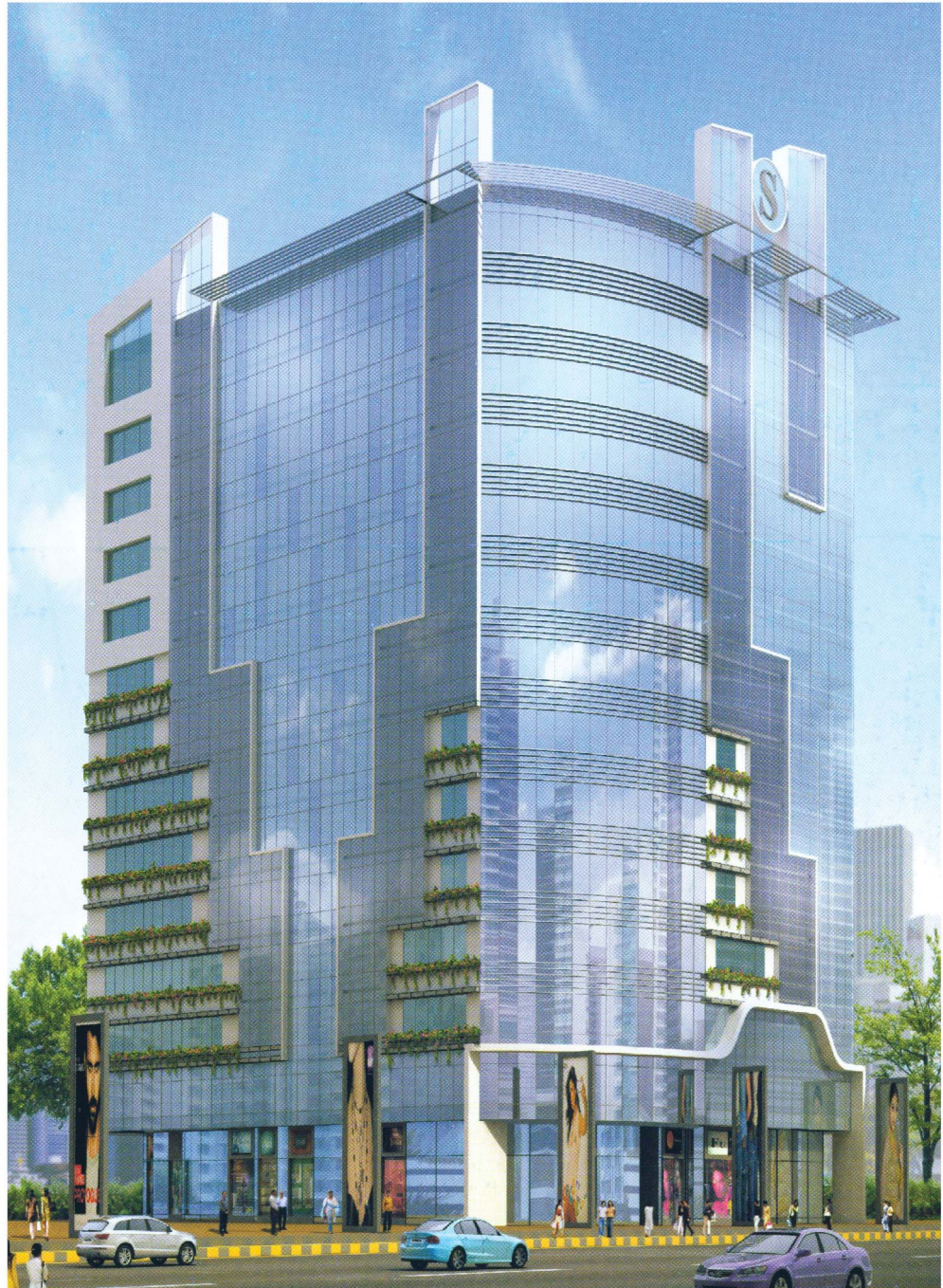
"Tulsi Chamber" Opp. Swastik Chambers, Chembur, Mumbai.