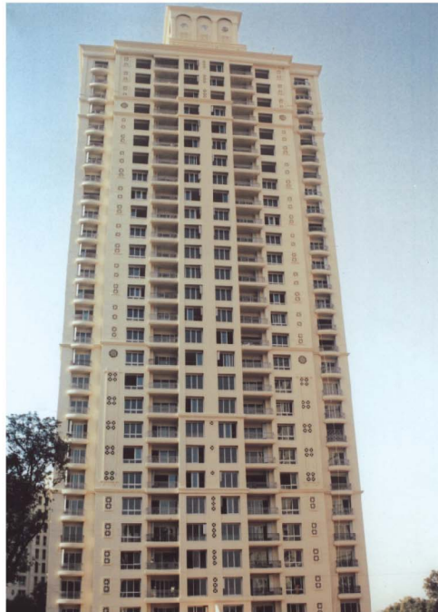
“ Evelina ” Hiranandani Estate, Patilpada, Thane (w).