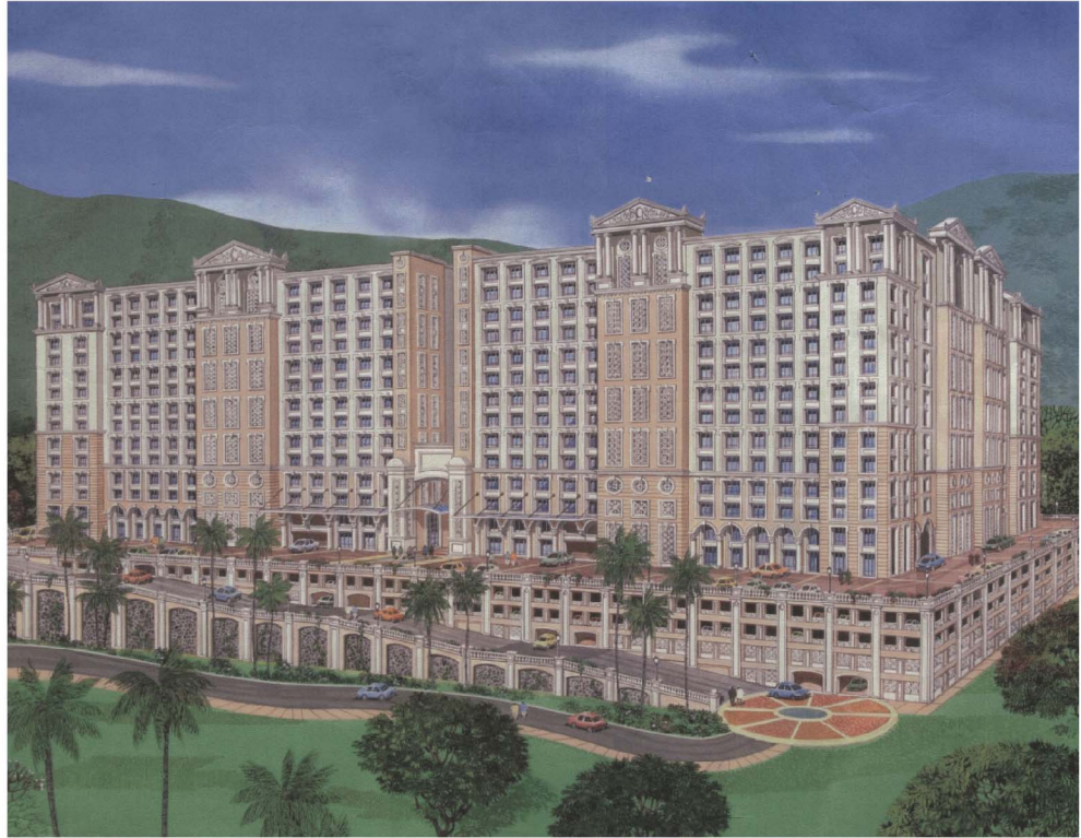
"Kensington" Hiranandani Garden, Powai.