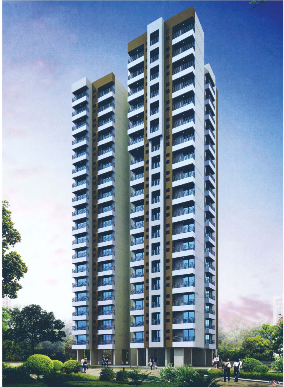
“ Dev Datt ” Opp. Dahisar Station, Dahisar (W), Mumbai.