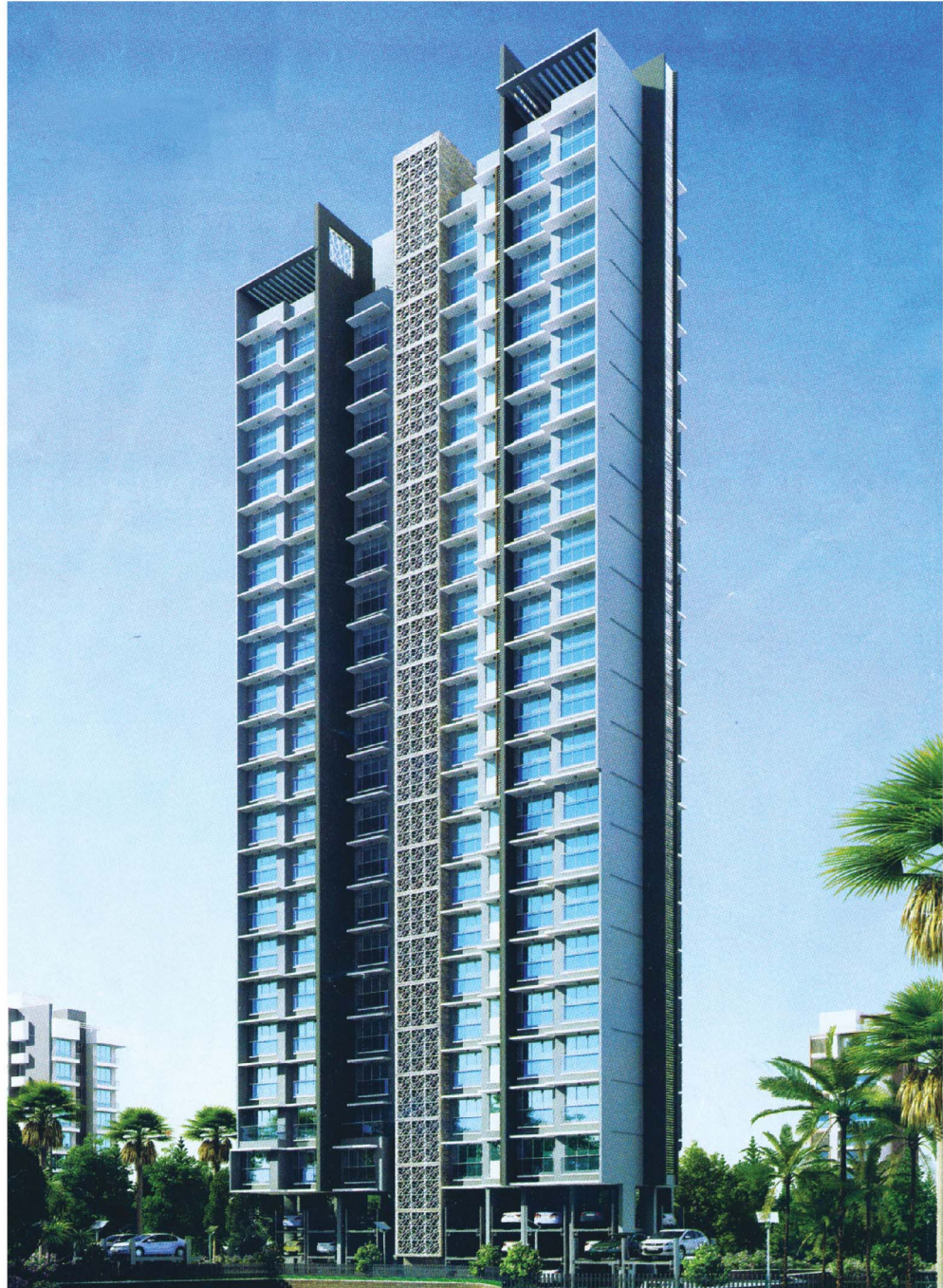
"Sadakamal" Sadakamal CHSL, C. S. Road, Dahisar.