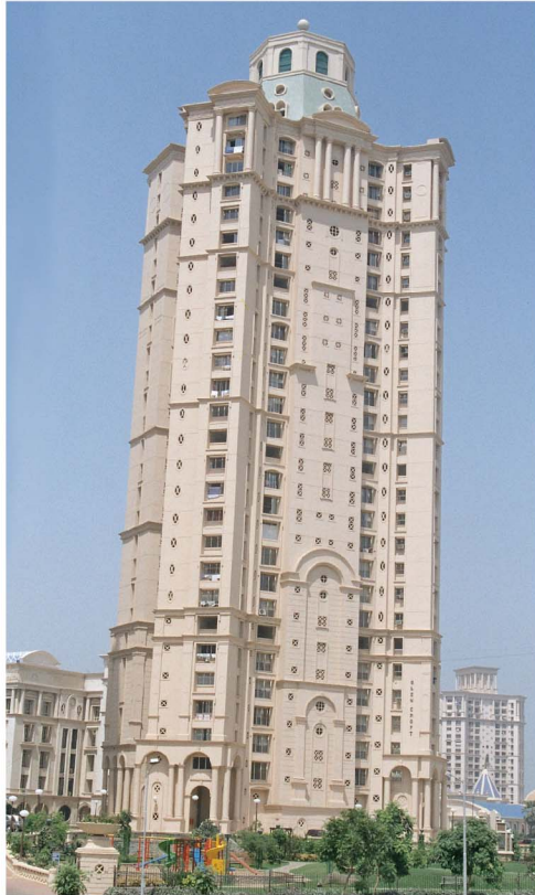
"Glen Croft" Hiranandani Gardens, Powai.