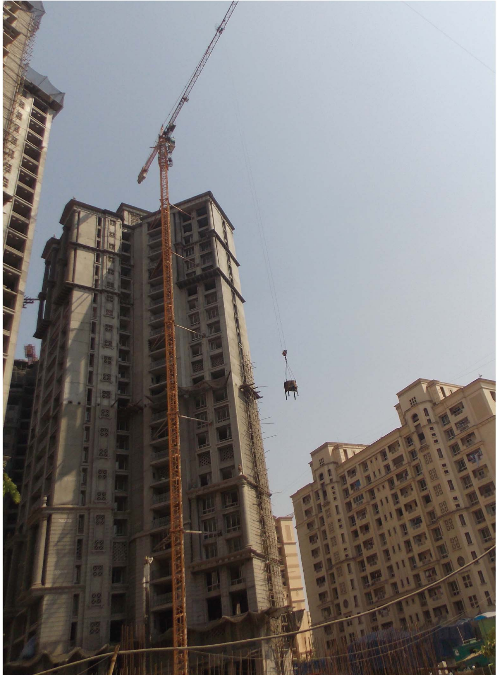
“ Clayton” (Work in progress) Rodas Enclave, Hiranandani Estate, Off. Ghodbunder Road, Thane.