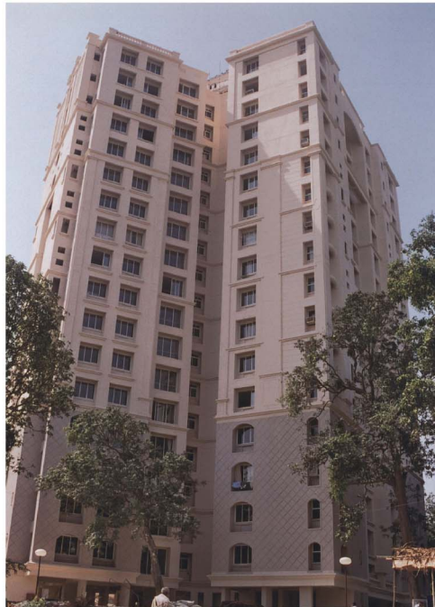
“ Green Wood ” Hiranandani Estate, Thane (w).