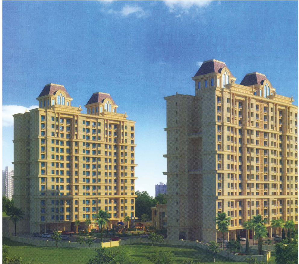
“Platinum Heritage” Hiranandani Estate, Behind Hiranandani Hospital, Thane (W)