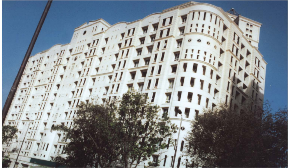
“ Crown ” Hiranandani Estate, Patilpada, Thane (w).