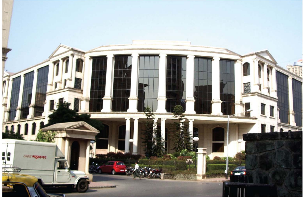
"Colgate Palmolive India Building" Hiranandani Gardens, Powai.